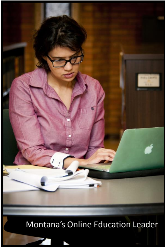
Montana's Online Education Leader